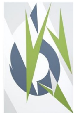
Lee Krasner's abstract artwork

To create imaginative work from various sources.